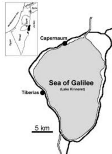
Sea of Kinneret

1 Now it happened that while the crowd was pressing around Him and listening to the word of God, He was standing by the lake of Gennesaret; 2 and He saw two boats lying at the edge of the lake; but the fishermen had gotten out of them and were washing their nets. 3 And He got into one of the boats, which was Simon's, and asked him to put out a little way from the land. And He sat down and began teaching the people from the boat. 4 When He had finished speaking, He said to Simon, "Put out into the deep water and let down your nets for a catch." 5 Simon answered and said, "Master, we worked hard all night and caught nothing, but I will do as You say and let down the nets." 6 When they had done this, they enclosed a great quantity of fish, and their nets began to break; 7 so they signaled to their partners in the other boat for them to come and help them. And they came and filled both of the boats, so that they began to sink. 8 But when Simon Peter saw that , he fell down at Jesus' feet, saying, "Go away from me Lord, for I am a sinful man!" 9 For amazement had seized him and all his companions because of the catch of fish which they had taken; 10 and so also were James and John, sons of Zebedee, who were partners with Simon. And Jesus said to Simon, "Do not fear, from now on you will be catching men." 11 When they had brought their boats to land, they left everything and followed Him.